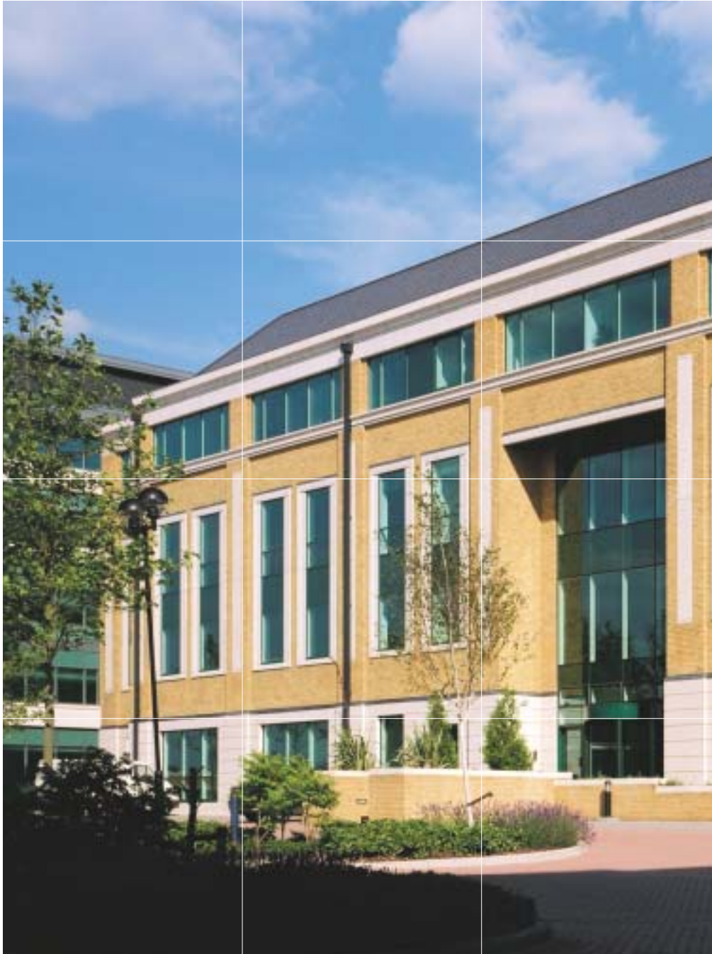
Arlington Square Bracknell