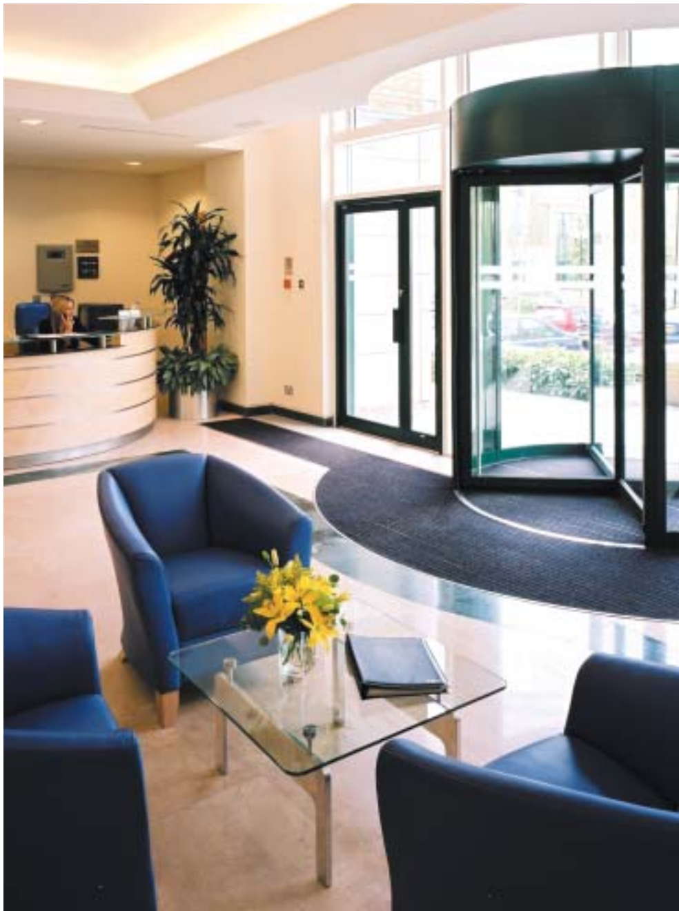
Reception area at Bracknell, Arlington Square