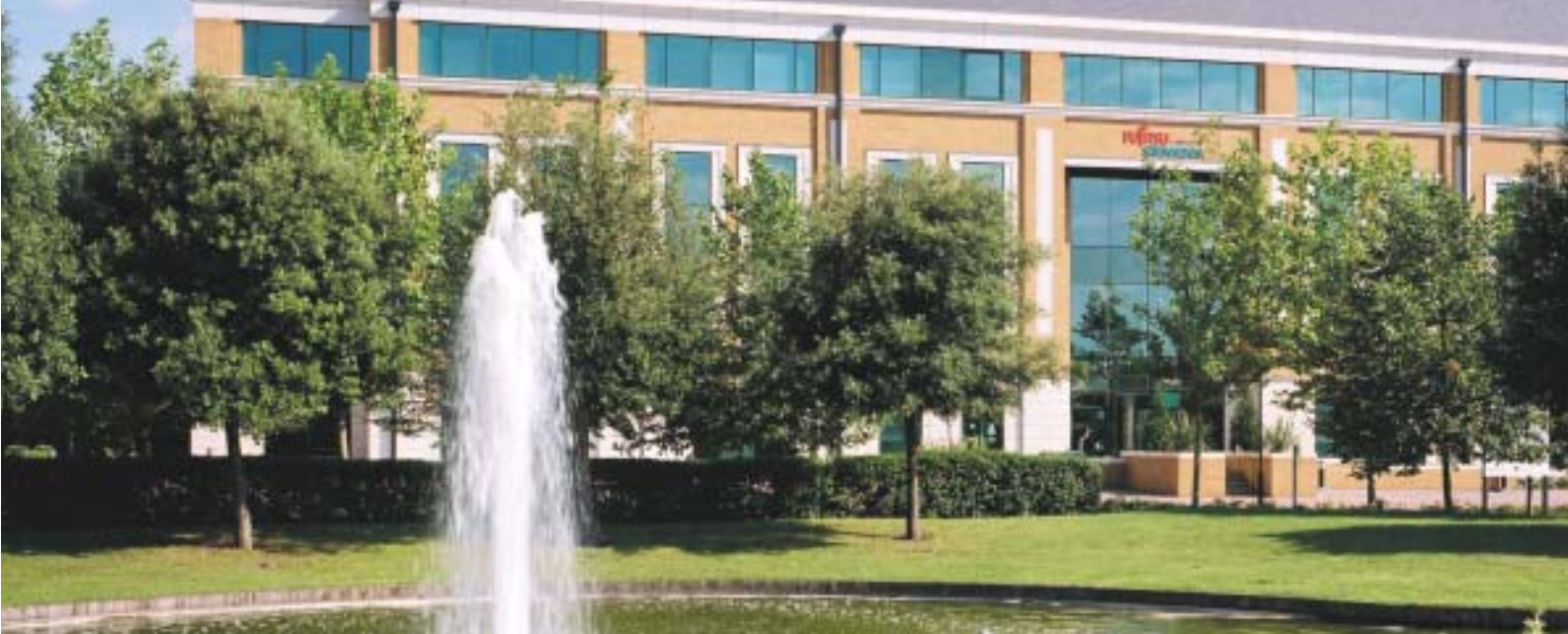
Bracknell, Arlington Square