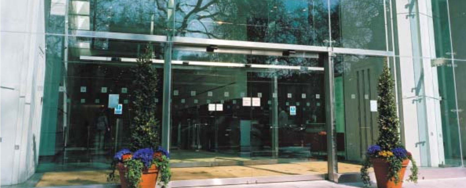
London Berkeley, Square