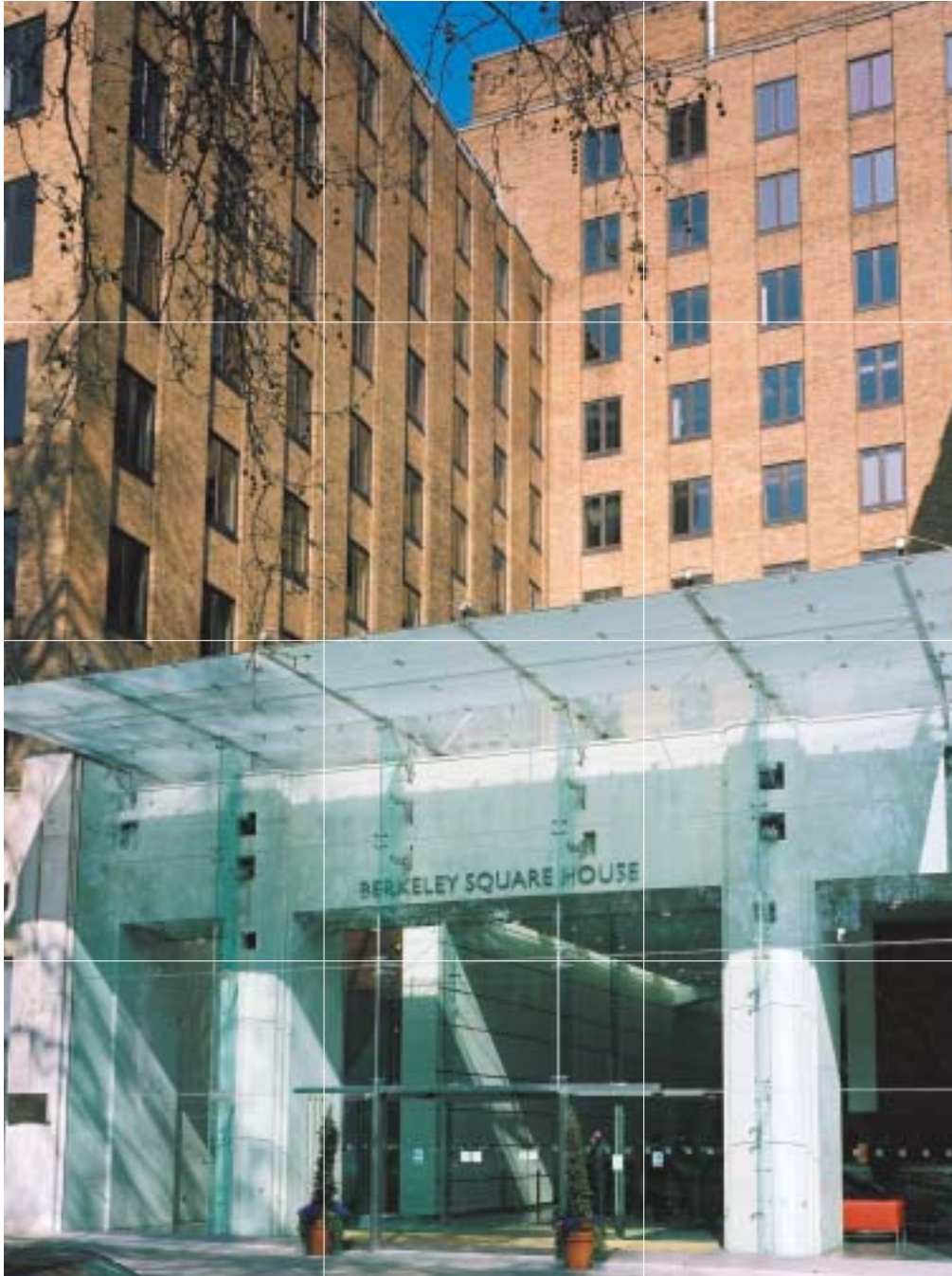
Berkeley Square London W1