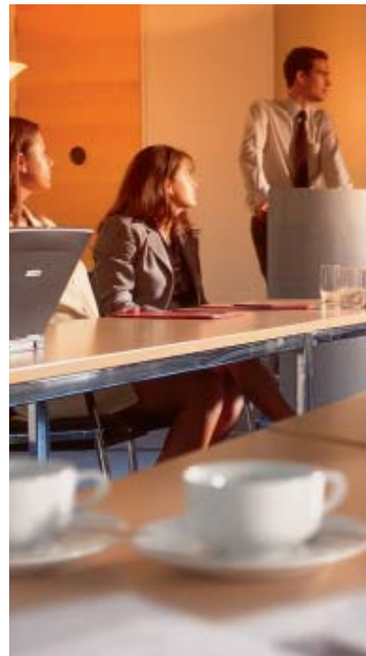
A typical Regus Meeting Room