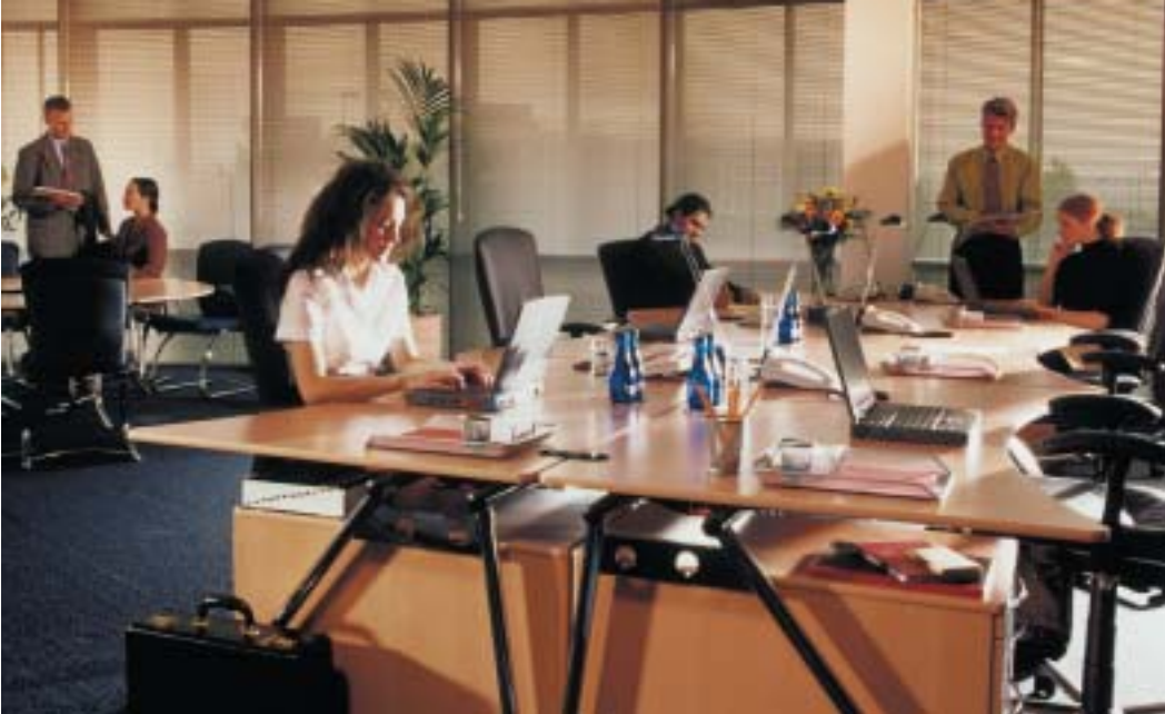
A typical Regus Office