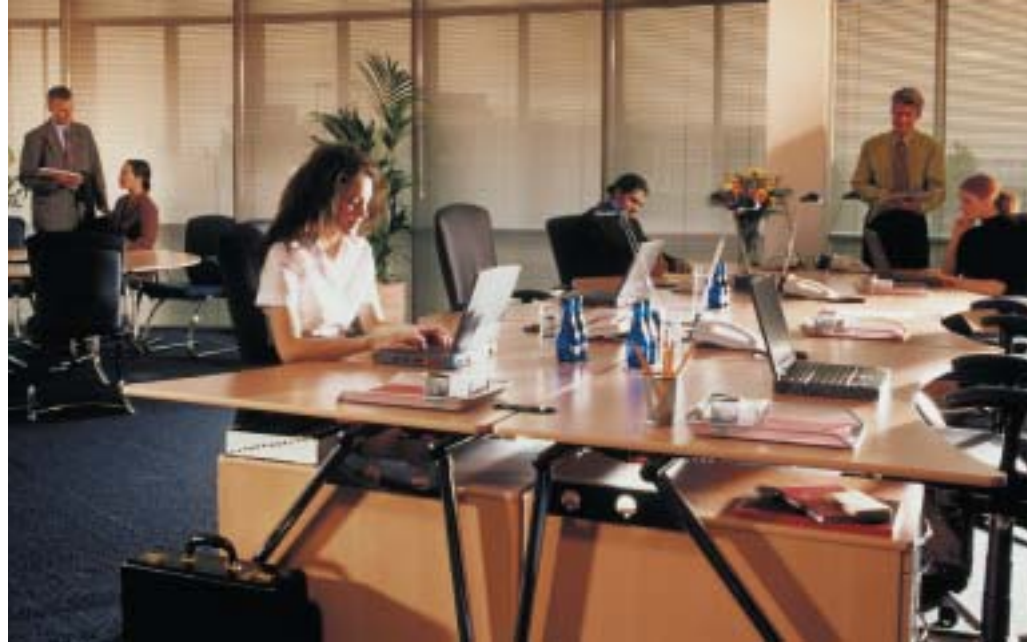
A typical Regus Office