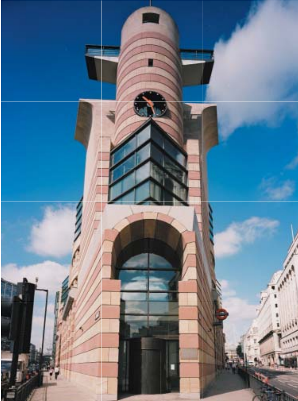
No. 1 Poultry London EC2