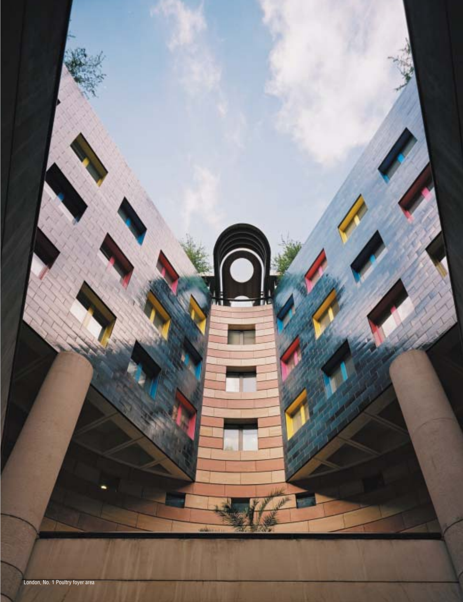
London, No. 1 Poultry foyer area