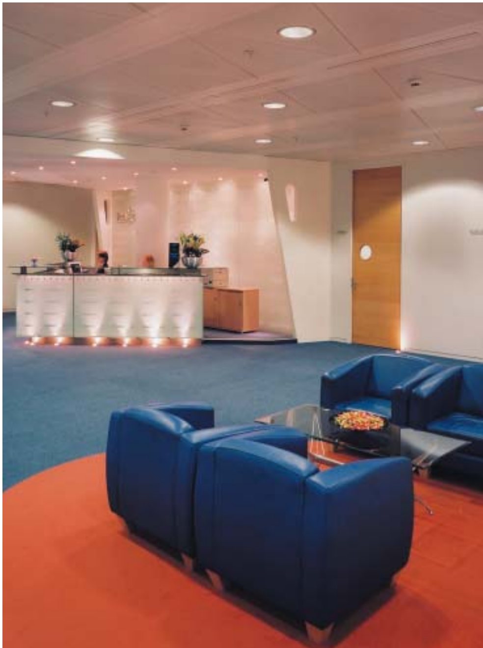
Reception area at London, No. 1 Poultry