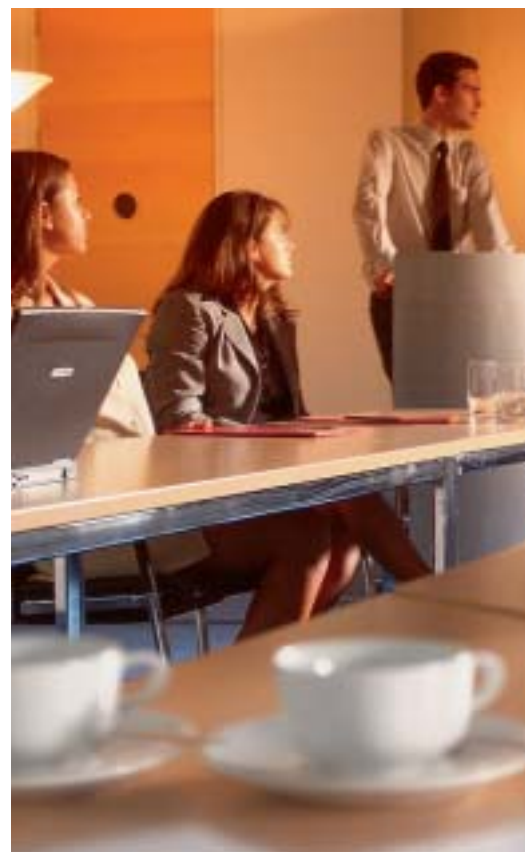
A typical Regus Meeting Room