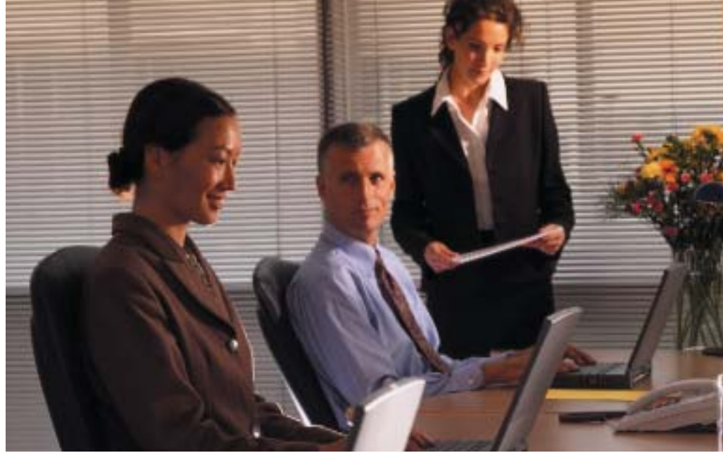
A typical Regus Office