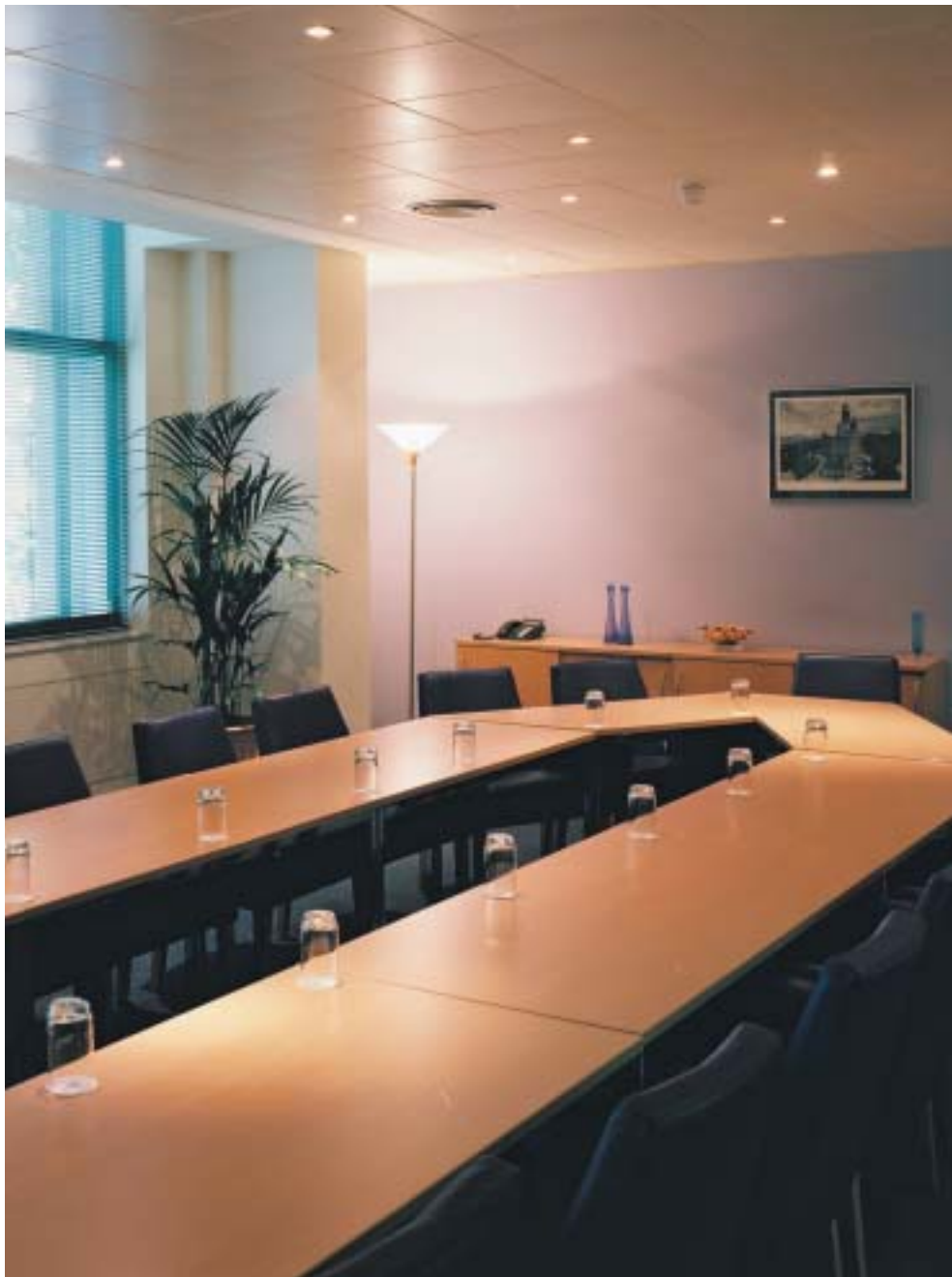
Conference Room at London, Trafalgar Square