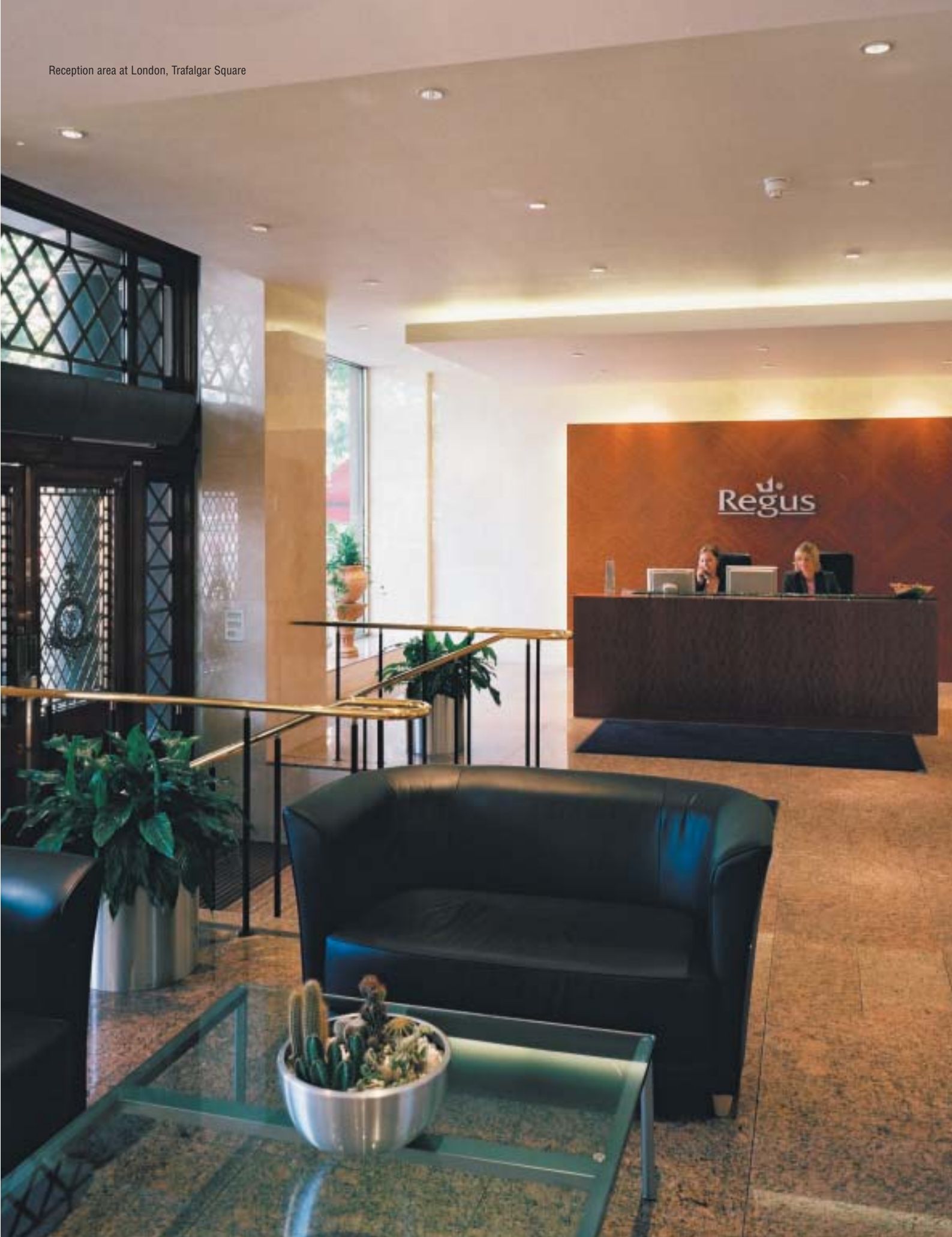
Reception area at London, Trafalgar Square