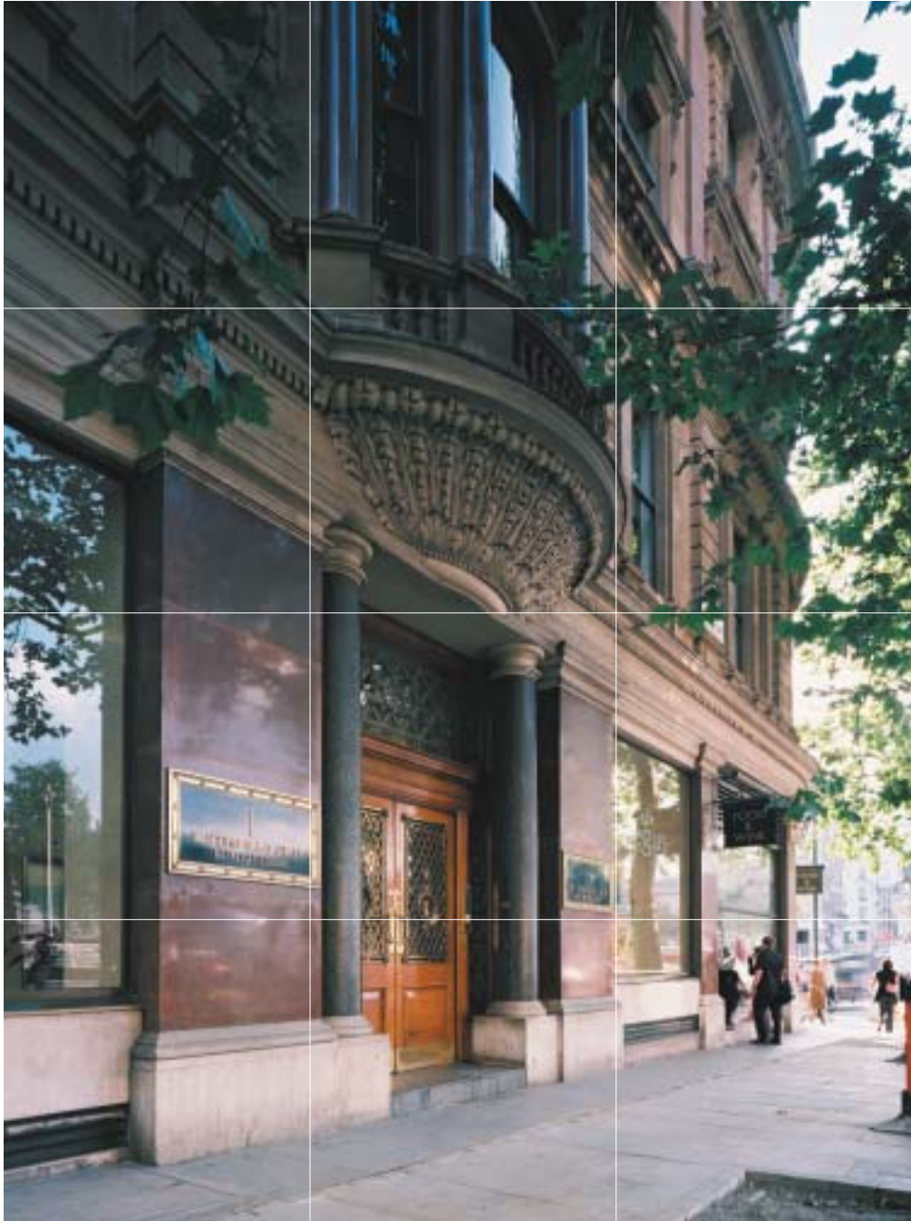
Trafalgar Square London WC2