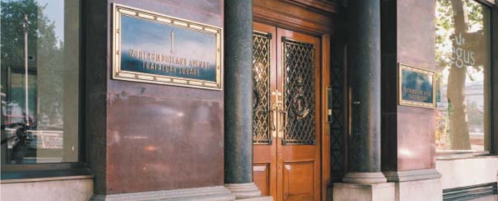
London, Trafalgar Square